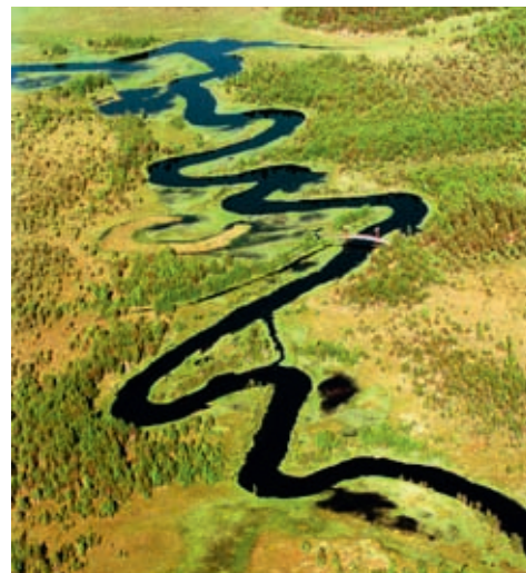
Nittälven twists its way through northern Örebro County.